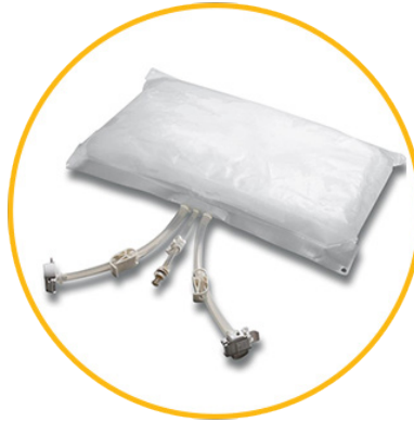
Figure 1. Sterile Plastic Containment Bag for Freeze-Thaw Processing. 1

Overall, the adoption of a well-tested, robust, simple-to-operate, single-use connection technology drives a standardized approach to future components and platform designs. Reduced system complexity and production costs are important to biopharmaceutical companies. Decoupling drug substance manufacturing from final drug product formulation and logistically moving biological material for cell and gene therapies are two new paradigms that are only conceivable because of single use tools that have recently been developed. Single-use assemblies with reliable component parts, such as the connectors supplied by CPC, are paving the way to new possibilities.