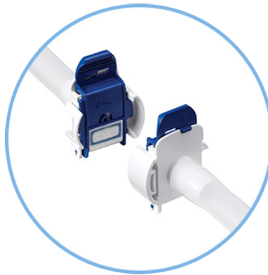
Figure 2. AseptiQuik G Connectors.