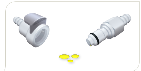
Standard shutoff valves