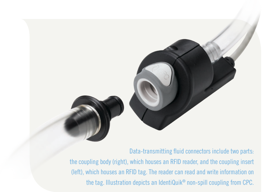
Data-transmitting fluid connectors include two parts: the coupling body (right), which houses an RFID reader, and the coupling insert (left), which houses an RFID tag. The reader can read and write information on the tag. Illustration depicts an IdentiQuik® non-spill coupling from CPC.