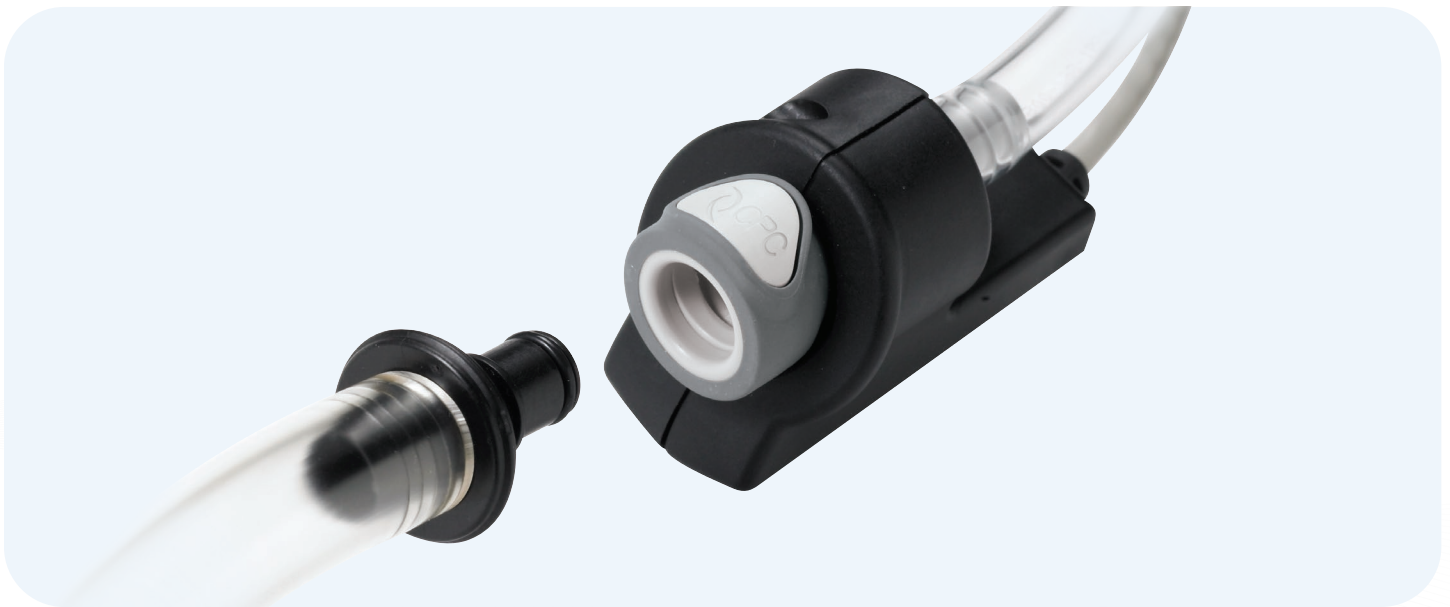
Data-transmitting fluid connectors include two parts: the coupling body (right), which houses an RFID reader, and the coupling insert (left), which houses an RFID tag. The reader can read and write information on the tag. Illustration depicts an IdentiQuik® non-spill coupling from CPC.